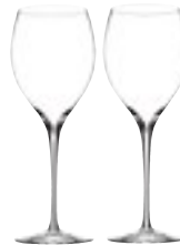
Chardonnay Pair 430ml (9cm x 24cm x 9cm) 7061 007