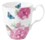
Vintage Mug White Friendship 400ml 9cm x 11cm 3501 193