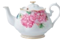
Teapot Friendship 450ml 3501 171