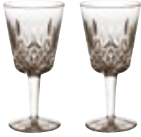
Goblet Pair 235ml (8cm x 17cm) 7055 001