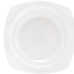
Deep Pasta / Salad Dish 28.5cm - 4701 706