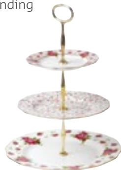
3 Tier Cake Stand 16cm, 20cm, 27cm, 35cm tall 3112 057