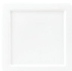
Condiment Tray Square 15cm - 3211 084