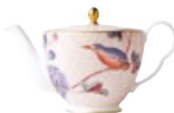
Teapot 0.37ltr 0430 170