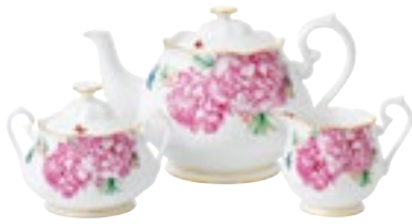
3 Piece Set Teapot, Cream & Sugar Friendship 1.2ltr, 350ml, 350ml 9cm x 8cm, 12cm x 7cm 3501 019