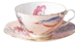
Peach Teacup and Saucer 0430 140