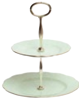
2 Tier Cake Stand 16cm, 20cm, 25cm tall 3114 057