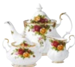
3 Piece Set Teapot, Sugar & Creamer 1.25Ltr, 350ml, 250ml 16cm x 15cm, 12cm x 7cm, 12cm x 9cm (Boxed) 3001 145