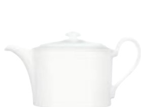
Teapots Delphi 22oz - 3211 570 14oz - 3211 571