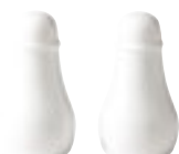
Salt & Pepper Plain 9cm Salt - 3211 007 Pepper - 3211 006