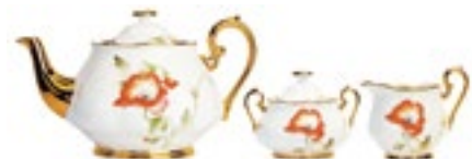
1970's Poppy Teapot, Sugar & Cream Jug Set 1.2Ltr, 350ml, 250ml 16cm x 15cm, 12cm x 7cm, 8cm x 8cm 3412 175