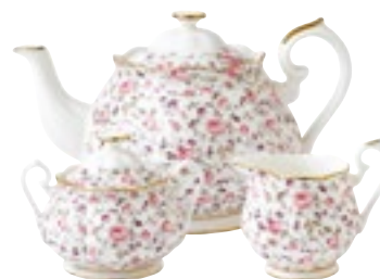
3 Piece Set Teapot, Sugar & Creamer 1.2Ltr, 350ml, 350ml 17cm x 15cm, 7cm x 12cm, 9cm x 12cm 3116 019