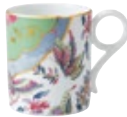
Butterfly Posy (Boxed in 'Archive Mug' box) 0454 221