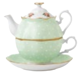
Tea for One 490ml/360ml 12cm x 17cm 3114 012