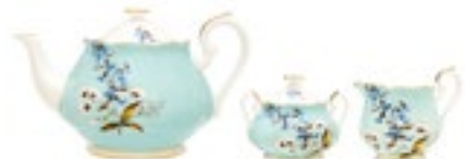
1950's Festival Teapot, Sugar & Cream Jug Set 1.2Ltr, 350ml, 250ml 16cm x 15cm, 12cm x 7cm, 8cm x 8cm 3412 155