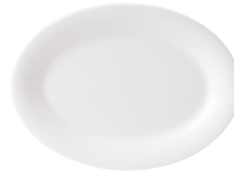
Oval Dishes Semi-Coupe 25cm - 4701 049 34cm - 4701 815 30cm - 4701 181