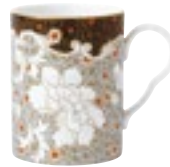
Mug Blue 0439 190