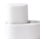
Salt & Pepper 5cm Salt - 4712 187 Pepper - 4712 186