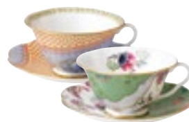
2 Teacups & Saucers Gift Set 0437 268