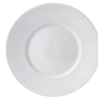
Wide Rim Plates 32cm - 4712 705 28cm - 4712 709