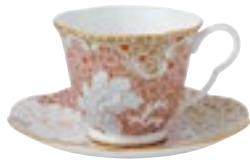
Pink Teacup & Saucer 0439 150