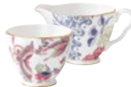
Sugar and Creamer 0437 145