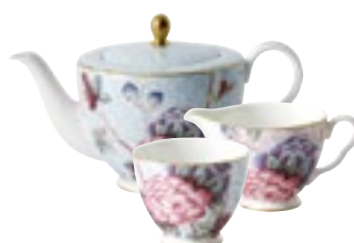
Teapot 1ltr, Sugar, Creamer Gift Set 0430 269