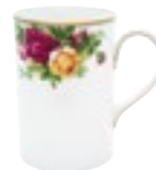
Tall Bone Mug Trimmed with 22 carat gold 3461 193