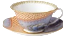
Blue Teacup and Saucer 0437 150