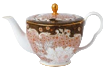
Teapot 1Ltr 0439 171