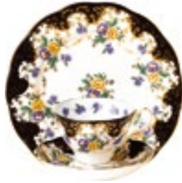
1910's Duchess Teacup, Saucer & 20cm Plate 180ml 9cm x 7cm, 14cm x 2cm, 20cm x 20cm 3412 110