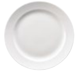
Plates Rolled Edge

29cm - 3211 054 22cm - 3211 052 27cm - 3211 051 18cm - 3211 053 25cm - 3211 050