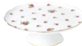
Pink Roses Large Cake Stand 30cm x 30cm x 10cm (Boxed) 3414 028