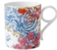
Spring Blossom (Boxed in 'Archive Mug' box) 0454 223