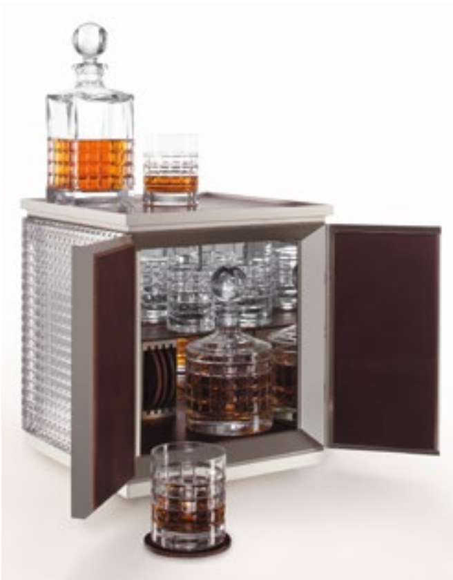
Desktop Bar 240v (33cm x 33cm x 35cm) Includes: Square Decanter, Round Decanter, DOF Pair, Hi Ball Pair, Leather Tray and Coasters 7135 554

Made in the United Kingdom Made from 24% lead crystal, leather and metal