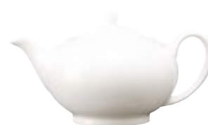
Teapots 146 28oz - 3211 172 14oz - 3211 171