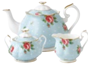
3 Piece Set Teapot, Sugar & Creamer 1.2Ltr, 350ml, 350ml 17cm x 15cm, 7cm x 12cm, 9cm x 12cm 3115 019