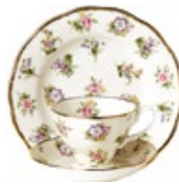
1920's Spring Meadow Teacup, Saucer & 20cm Plate 180ml 9cm x 7cm, 14cm x 2cm, 20cm x 20cm 3412 120