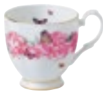
Mug Gratitude 300ml 3501 196