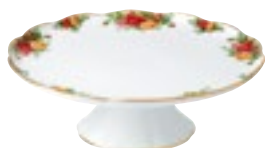
Cake Stand Large 30.5cm x 9.5cm 3706 001