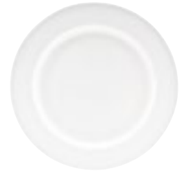
Plates Wide Rim 30cm - 4701 107 23cm - 4701 101 27cm - 4701 100 20cm - 4701 102 25cm - 4701 094 16cm - 4701 103