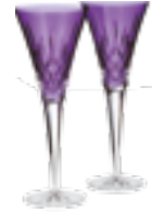
Amethyst Flute Pair 210ml (11cm x 23cm) 7055 241