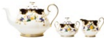
1910's Duchess Teapot, Sugar & Cream Jug Set 1.2Ltr, 350ml, 250ml 16cm x 15cm, 12cm x 7cm, 8cm x 8cm 3412 115