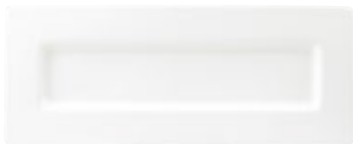
Flat Serving Tray 38 x 15.5cm - 3211 094