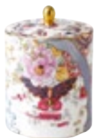
Tea Caddy 0437 100