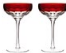
Talon Red Coupe Pair 177ml (9cm x 14cm x 9cm) 7054 773