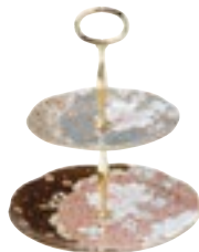
Two Tiered Cake Stand 0439 084