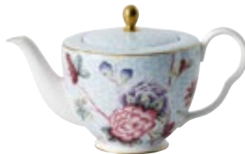
Blue Teapot 1ltr 0430 171