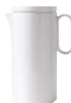
Beverage Pot 1L - 4712 145