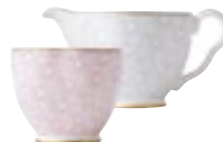
Sugar and Creamer Set (5cm high each) 0430 145