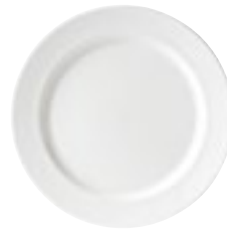
Plates Plain Edge

29cm - 3211 054 22cm - 3211 052 27cm - 3211 051 18cm - 3211 053 25cm - 3211 050