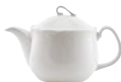
Teapot Small 19oz - 4702 077