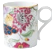
Floral Bouquet (Boxed in 'Archive Mug' box) 0454 222