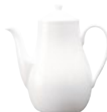
Coffee Pot Savoy 23oz - 3211 181