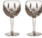
Balloon Wine Pair 235ml (9cm x 18cm) 7055 004