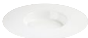
Flat Pasta 28cm - 3211 074