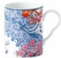
Mug 0437 190