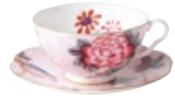
Pink Teacup and Saucer 0430 150