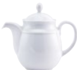
Teapot Large 42oz - 4701 145