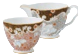
Sugar & Creamer Large 0439 145