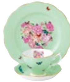
Blessings Teacup, Saucer & 20cm Plate 180ml 9cm x 7cm, 14cm x 2cm, 20cm x 20cm 3501 014