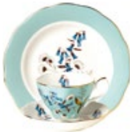
1950's Festival Teacup, Saucer & 20cm Plate 180ml 9cm x 7cm, 14cm x 2cm, 20cm x 20cm 3412 150