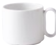
Mug 10oz - 4712 430