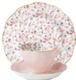
Teacup, Saucer & Plate Set 180ml 9cm x 7cm, 14cm x 2cm, 20cm x 2cm 3116 014