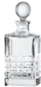
Square Decanter (9cm x 25cm) 7035 750