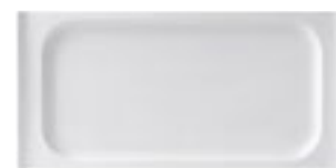
Rectangular Trays 43 x 20cm - 4712 300 36 x 17cm - 4712 301 31 x 15cm - 4712 302