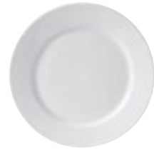
Regular Rim Plates 30cm - 4712 107 21cm - 4712 001 27cm - 4712 011 16cm - 4712 002 23cm - 4712 033