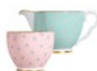
Sugar & Creamer Set (5cm high each) 0433 145