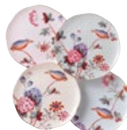
Set of 4 20cm Plates 0430 446