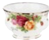
Sugar Bowl L/S Open 250ml 12cm x 13cm x 9cm 3001 140