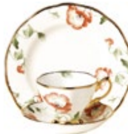
1970's Poppy Teacup, Saucer & 20cm Plate 180ml 9cm x 7cm, 14cm x 2cm, 20cm x 20cm 3412 170