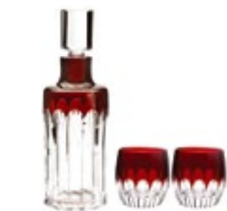
Talon Red Decanter & DOF Pair (Decanter - 9cm x 26cm, Tumblers - 9cm x 9cm) 7054 755