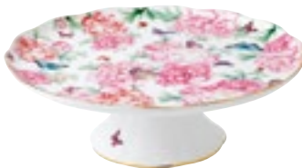
Cake Plate Large 30cm x 30cm x 10cm 3501 055