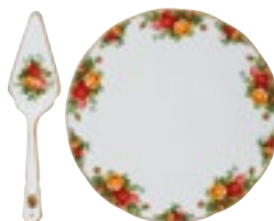
Cake Plate & Server Server 29cm, Plate 28cm 3706 009