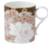
Small Mug Pink 0439 191