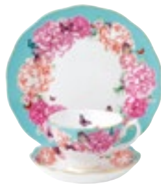
Devotion Teacup, Saucer & 20cm Plate 180ml 9cm x 7cm, 14cm x 2cm, 20cm x 20cm 3501 017