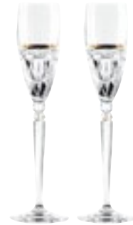
Flute Pair (8cm x 27cm) 7036 619