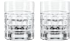
DOF Pair 400ml (8cm x 10cm) 7035 635