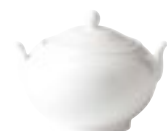
Covered Sugar Bowls 146 11cm - 3211 144 9cm - 3211 145