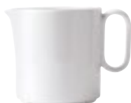
Jug Large 280ml - 4712 172