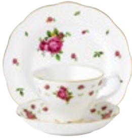
Teacup, Saucer & Plate Set 180ml 9cm x 7cm, 14cm x 2cm, 20cm x 2cm 3112 014