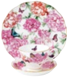
Gratitude Teacup, Saucer & 20cm Plate 180ml 9cm x 7cm, 14cm x 2cm, 20cm x 20cm 3501 016