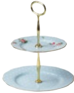
2 Tier Cake Stand 16cm, 20cm, 25cm tall 3115 057