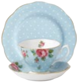
Teacup, Saucer & Plate Set 180ml 9cm x 7cm, 14cm x 2cm, 20cm x 2cm 3115 014