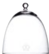
Small Glass Dome 14cm x 14cm x 15cm 3414 033