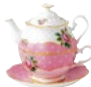
Tea for One 490ml/360ml 12cm x 17cm (Boxed) 3117 010