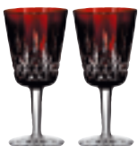
Lismore Ruby Goblet Pair 7129 034