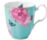
Vintage Mug Turquoise Friendship 400ml 9cm x 11cm 3501 190