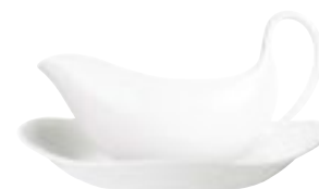
Sauce Boat & Stand Boat 12.5oz Stand 14cm 3211 091 3211 092