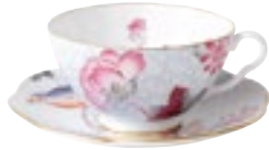
Blue Teacup and Saucer 0430 160