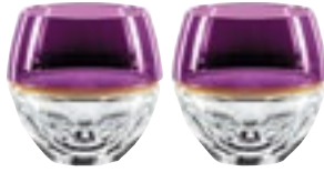
Rock Glass Pair Amethyst (Cased) (9cm x 9cm) 7036 006