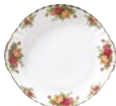
Cake Plate 26cm x 26cm x 3cm 3001 054