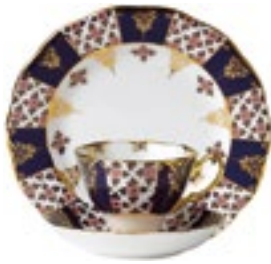
1900's Regency Blue Teacup, Saucer & 20cm Plate 180ml 9cm x 7cm, 14cm x 2cm, 20cm x 20cm 3412 100