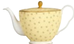
Teapot 0.37ltr 0433 170