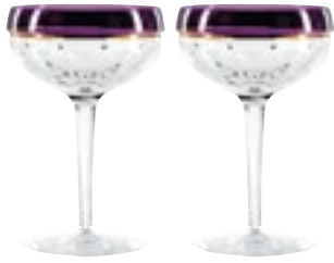
Champagne Coupe Pair Amethyst (Cased) (11cm x 16cm) 7036 003