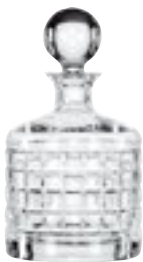
Round Decanter (12cm x 22cm) 7035 751