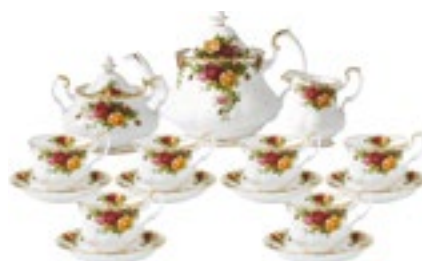
15 Piece Tea Set Teapot, Sugar, Creamer, 6 Teacup & Saucer 1.25Ltr, 350ml, 250ml, 200ml 16cm x 15cm, 12cm x 7cm, 12cm x 9cm, 9cm x 7cm, 14cm x 2cm (Boxed) 3001 015