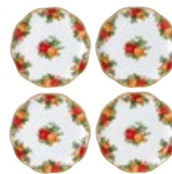
Plates 10cm Set of 4 10cm x 10cm 3706 008