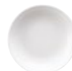
Butter Dish 11cm - 3211 301