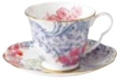
Blue and Pink Teacup and Saucer 0437 160