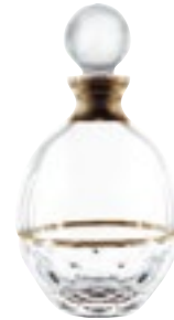
Decanter (13cm x 23cm) 7036 750