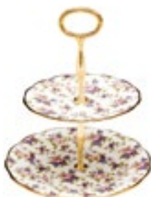
1940's English Chintz 2 Tier Cake Stand 3412 642