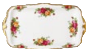
Sandwich Tray 17cm x 30cm x 2cm 3001 239