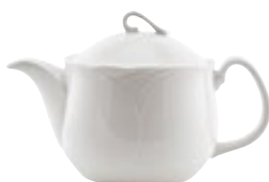
Teapot Large 37oz - 4702 068