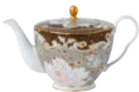
Teapot 0.5Ltr 0439 170