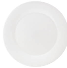
Plates Semi-Coupe 27cm - 4701 809 16cm - 4701 810