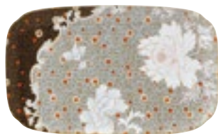
Sandwich Tray 25cm 0439 236