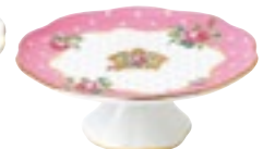
Cheeky Pink Small Cake Stand 17cm x 17cm x 6cm (Boxed) 3414 029