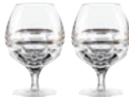
Brandy Glass Pair (10cm x 15cm) 7036 623