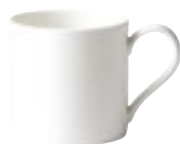
Mug Boehm 11oz - 3211 190