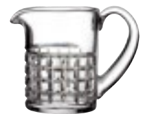
Small Water Pitcher 560ml 12cm x 10cm x 14cm 7035 742