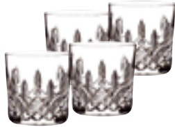
Tumbler Set of 4 266ml (8cm x 9cm) 7055 737