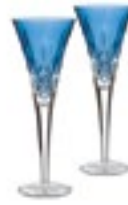
Sapphire Flute Pair 210ml (11cm x 23cm) 7055 239