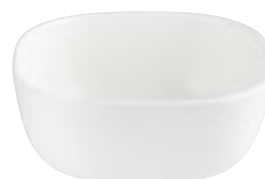
Coupe Square Bowl 15cm - 3211 245 10cm - 3211 247 12.5cm - 3211 246