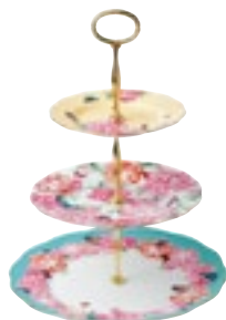
3 Tier Cake Stand 16cm, 20cm, 27cm 3501 057