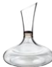
Modern Carafe 2.5Ltr (24cm x 27cm) 7061 015