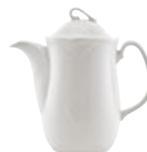
Coffee Pot Small 20oz - 4702 302