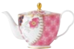
Teapot 0.37ltr 0437 170