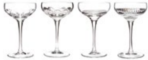
Set of 4 Mixed Coupes Clear 177ml (9cm x 15cm) 7054 004