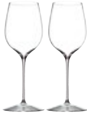
Pinot Noir Pair 550ml (9cm x 25cm x 9cm) 7061 004