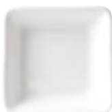
Square Sweet Dish 11cm - 3211 300