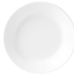
Deep Plate 35cm - 4701 827