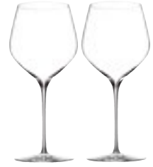
Cabernet Sauvignon Pair 790ml (11cm x 25cm x 11cm) 7061 002