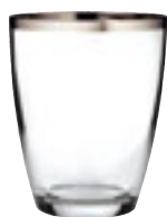
Champagne Cooler 6Ltr (21cm x 25cm x 21cm) 7061 013

Decanters, carafe and cooler are trimmed with platinum.