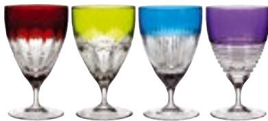
Mixed Set of 4 All Purpose Colour 295ml (9cm x 25cm x 9cm) 7054 770