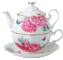
Tea For One Friendship 490ml/360ml 3501 012