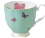
Mug Blessings 300ml 3501 194