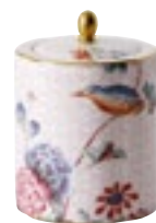
Tea Caddy 0430 100