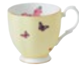
Mug Joy 300ml 3501 195