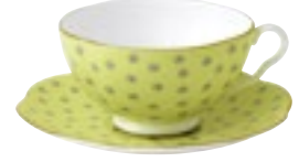
Teacup & Saucer Green 0433 066