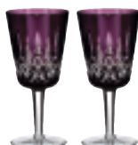
Lismore Amethyst Goblet Pair 7129 035