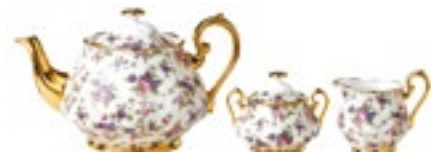
1940's English Chintz Teapot, Sugar & Cream Jug Set 1.2Ltr, 350ml, 250ml 16cm x 15cm, 12cm x 7cm, 8cm x 8cm 3412 145