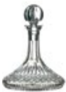
Ship's Decanter 800ml (22cm x 23cm) 7124 555