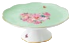
Cake Plate Small 17cm x 17cm x 6cm 3501 054