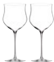
Rose Pair 430ml (9cm x 21cm x 9cm) 7061 006