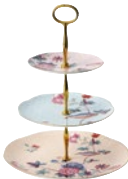
3 Tiered Cake Stand 0430 057