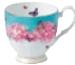
Mug Devotion 300ml 3501 197