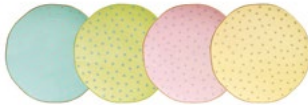
Set 4 Plates 15cm each 0433 446