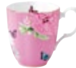
Vintage Mug Pink Friendship 400ml 9cm x 11cm 3501 192