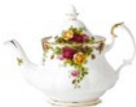
Teapot L/S 1.25Ltr 16cm x 26cm x 16cm 3001 170