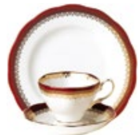
1980's Holyrood Teacup, Saucer & 20cm Plate 180ml 9cm x 7cm, 14cm x 2cm, 20cm x 20cm 3412 180