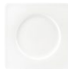
Flat Show Plate Square 24cm - 3211 085