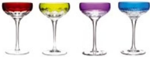
Set of 4 Mixed Coupes Colour 177ml (9cm x 15cm) 7054 005