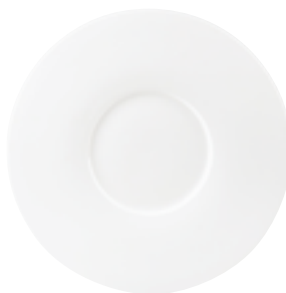
Flat Show Plates 31cm - 3211 055 24.5cm - 3211 057 28cm - 3211 056 17cm - 3211 058