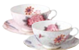
2 Teacups & Saucers Gift Set 0430 268