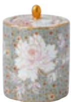
Tea Caddy 0439 100