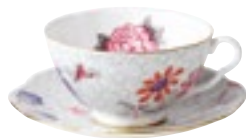
Green Teacup and Saucer 0430 130