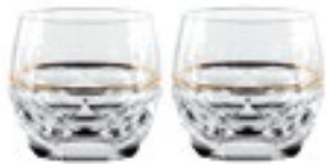
Rock Glass Pair (9cm x 8cm) 7036 635