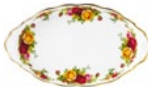
Sugar & Cream Tray 15cm x 25cm x 2cm 3001 153