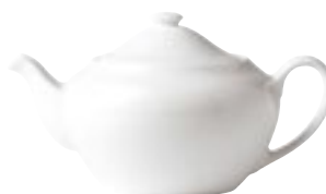
Teapots Savoy 31oz - 3211 170 22oz - 3211 176