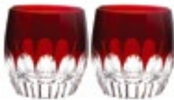
Talon Red DOF Pair 300ml (9cm x 9cm) 7054 735