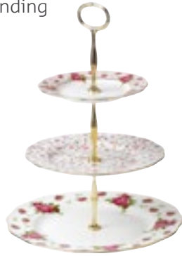
3 Tier Cake Stand 16cm, 20cm, 27cm, H:35cm 3112 057