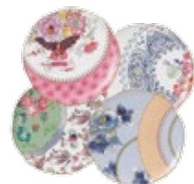
Set 4 Plates 20cm each 0437 446