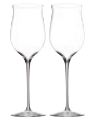
Riesling Pair 380ml (8cm x 24cm x 8cm) 7061 010