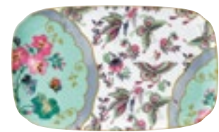
Sandwich Tray 25cm 0437 236