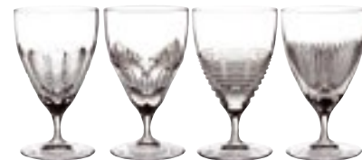
Mixed Set of 4 All Purpose Clear 295ml (9cm x 25cm x 9cm) 7054 771