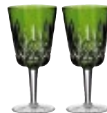
Lismore Emerald Goblet Pair 7129 036