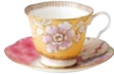
Yellow Teacup and Saucer 0437 140