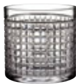
Ice Bucket 1.5L 15cm x 15cm x 15cm 7035 200