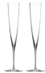
Champagne Trumpet Flute Pair 170ml (5cm x 28cm x 5cm) 7061 012