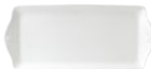
Sandwich Tray 36.5 x 16cm - 3211 239