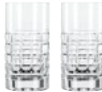
Hi Ball Pair (7cm x 13cm) 7035 628