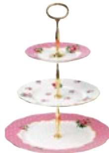
3 Tier Cake Stand 16cm, 20cm, 27cm, H:35cm (Boxed) 3117 057