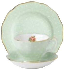
Teacup, Saucer & Plate Set 180ml 9cm x 7cm, 14cm x 2cm, 20cm x 2cm 3114 014