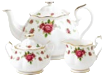
3 Piece Set Teapot, Sugar & Creamer 1.2Ltr, 350ml, 350ml 17cm x 15cm, 7cm x 12cm, 9cm x 12cm 3112 019