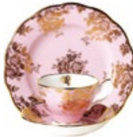
1960's Golden Roses Teacup, Saucer & 20cm Plate 180ml 9cm x 7cm, 14cm x 2cm, 20cm x 20cm 3412 160