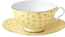
Teacup & Saucer Yellow 0433 067