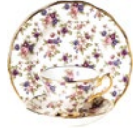
1940's English Chintz Teacup, Saucer & 20cm Plate 180ml 9cm x 7cm, 14cm x 2cm, 20cm x 20cm 3412 140