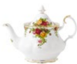
Teapot M/S 800ml 3001 172