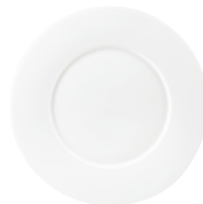
Service Plate Lincoln 31cm - 3211 059