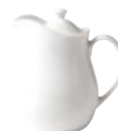
Covered Jug Savoy 14oz - 3211 157