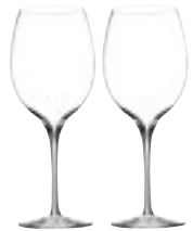
Pinot Gris/Grigio Pair 510ml (9cm x 23cm x 9cm) 7061 008