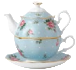
Tea for One 490ml/360ml 12cm x 17cm 3115 012