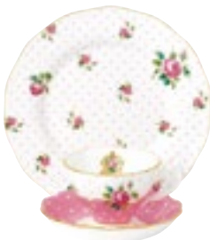
Teacup, Saucer & Plate Set 180ml 9cm x 7cm, 14cm x 2cm, 20cm x 2cm (Boxed) 3117 014