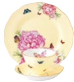
Joy Teacup, Saucer & 20cm Plate 180ml 9cm x 7cm, 14cm x 2cm, 20cm x 20cm 3501 015