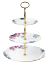
3 Tiered Cake Stand 0437 057