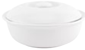
Tureen 68oz - 4701 801