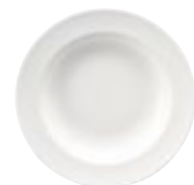
Soup Plate Rimmed 23cm - 3211 073