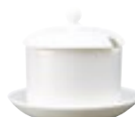
Jam Dish & Cover Body - 3211 302 Cover - 3211 303 Stand - 3211 301