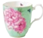
Vintage Mug Green Friendship 400ml 9cm x 11cm 3501 191