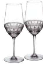
Wine Glass Pair 295ml 24cm x 8cm x 8cm 7035 712

Made in the United Kingdom Made from 24% lead crystal, leather and metal