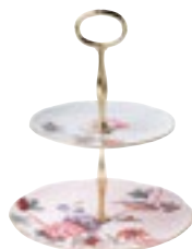
Two Tier Cake Stand 16cm (20cm Plates) 0430 084