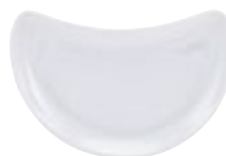
Crescent Salad 18cm - 4701 237