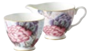
Sugar and Creamer Large (9cm high each) 0430 245