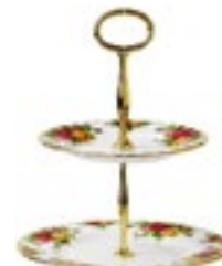
2 Tier Cake Stand (Boxed) 3001 057