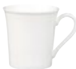
Beaker Delphi 9oz - 3211 191