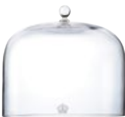
Large Glass Dome 27cm x 27cm x 25cm 3414 032