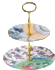
2 Tiered Cake Stand 0437 084