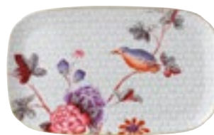
Sandwich Tray 25 x 15cm 0430 236