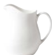
Jugs Savoy 14oz - 3211 159 5oz - 3211 158 9.5oz - 3211 151