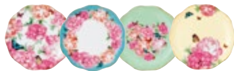
Set of 4 Plates 11cm 10cm x 10cm x 2cm 3501 210