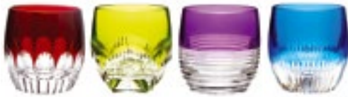
Set of 4 Mixed DOF Colour 300ml (9cm x 9cm) 7054 739