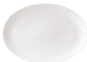
Oval Steak Dishes 35.5 x 25.5cm - 3211 080 29 x 21.5cm - 3211 082 23 x 16.5cm - 3211 083