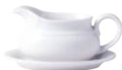
Gravy Boat & Stand / Oval Tray 17.25oz Boat - 4701 110 19cm Stand - 4701 111