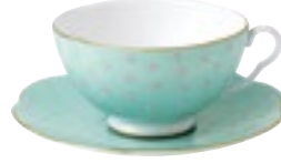
Teacup & Saucer Turquoise 0433 069