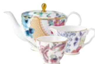
Teapot 1ltr, Sugar, Creamer Gift Set 0437 269