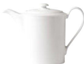
Coffee Pot Delphi 26oz - 3211 580