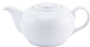
Teapot 38oz - 4701 148