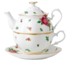
Tea for One 490ml/360ml 12cm x 17cm 3112 012