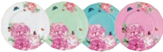
Set of 4 Plate 20cm 20cm x 20cm x 2cm 3501 200