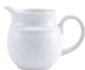
Jug 10oz - 4701 172 5oz - 4701 171