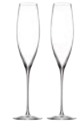
Champagne Classic Pair 220ml (6cm x 28cm x 6cm) 7061 011