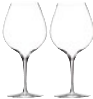
Merlot Pair 660ml (11cm x 22cm x 11cm) 7061 003