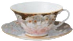
Blue Teacup & Saucer 0439 160