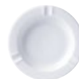
Ashtray 14cm - 4701 074