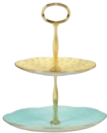
2 Tiered Cake Stand 15cm (20cm Plates) 0433 084