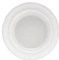
Deep Pasta / Salad Dish 28.5cm - 4702 706

30cm - 4702 107 23cm - 4702 033 27.5cm - 4702 011 21cm - 4702 001 26cm - 4702 032 16.5cm - 4702 002