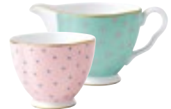
Sugar & Creamer Set Large 0433 245