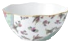
Gift Bowl 25cm 0437 232