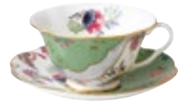
Green Teacup and Saucer 0437 130