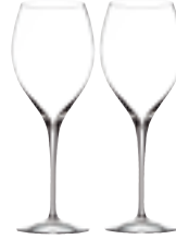
Syrah/Shiraz Pair 440ml (9cm x 22cm x 9cm) 7061 005