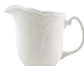
Cream Jug Large 10oz - 4702 025