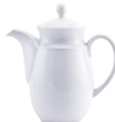
Coffee Pot Large 35oz - 4701 141