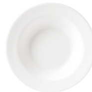
Rimmed Soup 22cm - 4701 175

With its lasting strength, Jupiter is affordable, yet extremely durable and robust. Fine china in its purest plain white form.