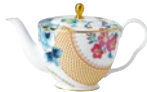
Teapot 1ltr 0437 171