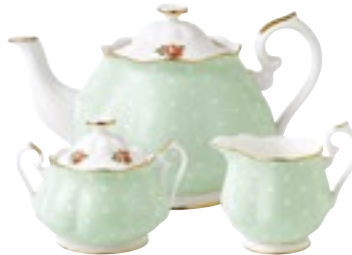
3 Piece Set Teapot, Sugar & Creamer 1.2Ltr, 350ml, 350ml 17cm x 15cm, 7cm x 12cm, 9cm x 12cm 3114 019