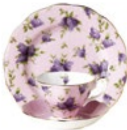
1990's Hartington Lane Teacup, Saucer & 20cm Plate 180ml 9cm x 7cm, 14cm x 2cm, 20cm x 20cm 3412 190